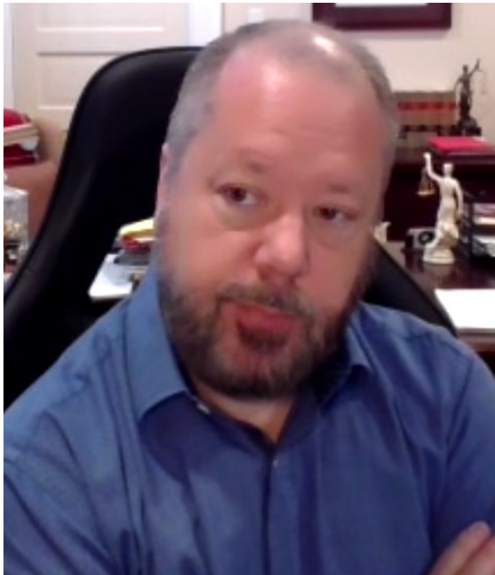
Speaker Bill Hicks