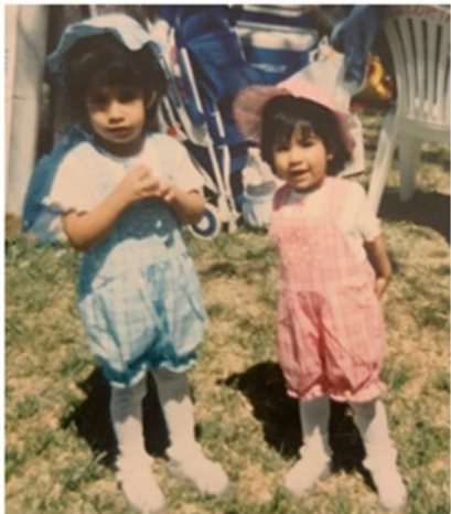
Photo of my girls in my early Paralegal Days.